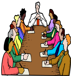
FIG MEETING — VERY IMPORTANT — PLEASE ATTEND!!!

The Frankfort Investment Group (FIG) Shareholder Annual Meeting will be held on Sunday, March 29, 2009, at 1:00 p.m. at the American Legion, 164 Versailles Road, Frankfort. This is your meeting!