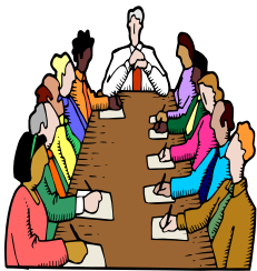
FIG MEETING — VERY IMPORTANT — PLEASE ATTEND!!!

The Frankfort Investment Group (FIG) Shareholder Annual Meeting will be held on Sunday, March 29, 2009, at 1:00 p.m. at the American Legion, 164 Versailles Road, Frankfort. This is your meeting!